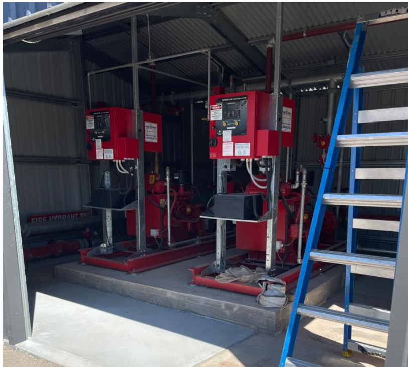
New diesel-powered fire pumps installed at the airport

Council carried out works to replace old electrical fire pumps with two (2) new diesel-powered fire pumps and associated equipment including a new enclosure in 2022 and 2023.