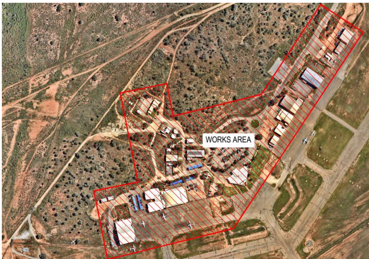
Extent of the works area

The works under this request will be carried out both landside and airside at the Broken Hill Airport.