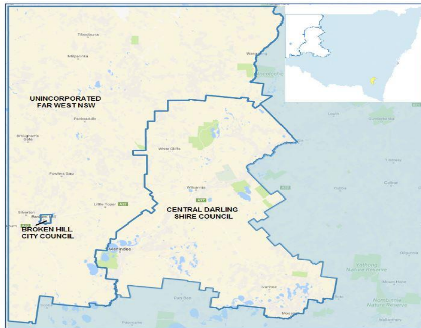
Functional Economic Region